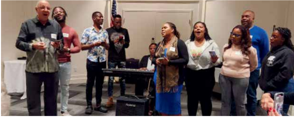
Jamaican Choir entertaining host families in Naples, FL. Returning February 15th, 2025.

“Jamaica Outreach Program (JOP) is a non-profit 501 (c)(3) public charity whose mission is to help the poor in Jamaica. JOP provides love, respect, funds, goods, and services for health care, education, and basic support to improve the lives of the poor in Jamaica without regard to religious affiliation, personal history, gender, age, or race.”