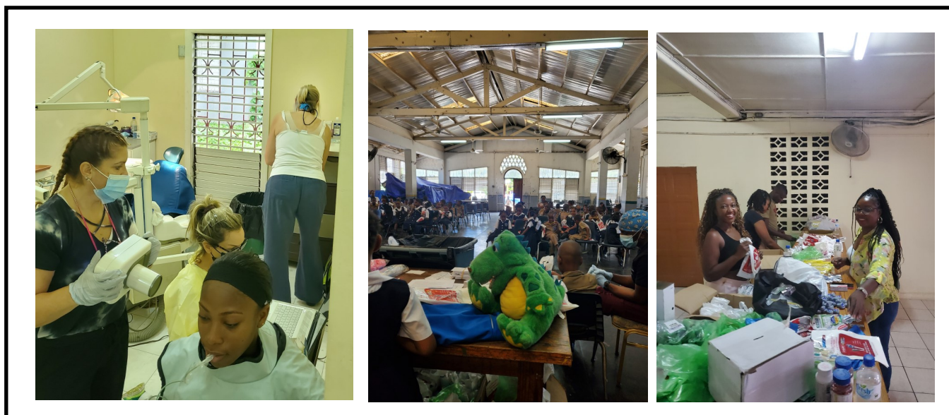
Dental Mission Fall 2022