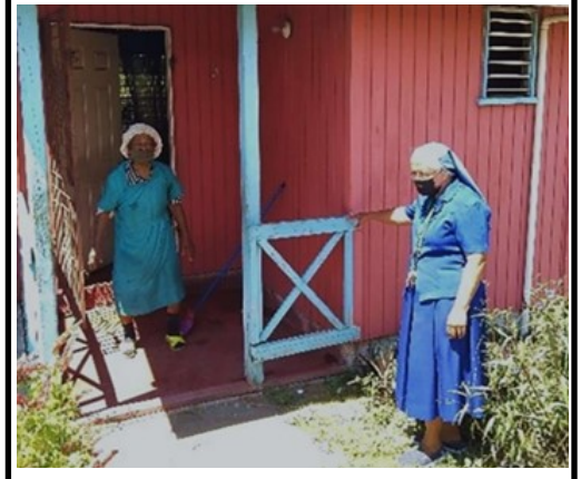
Antonino Gabriele Village

Beyond this initial JOP grant in early 2022, their future needs include support for food, utilities and repairs. JOP hopes to be a major donor to this project.