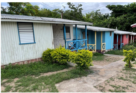
Antonino Gabriele Village