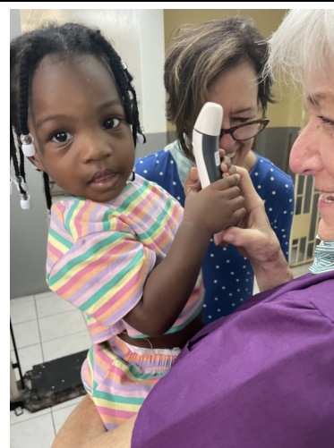
Fall Medical Mission