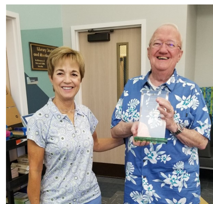
JOP Board Retirement 2019