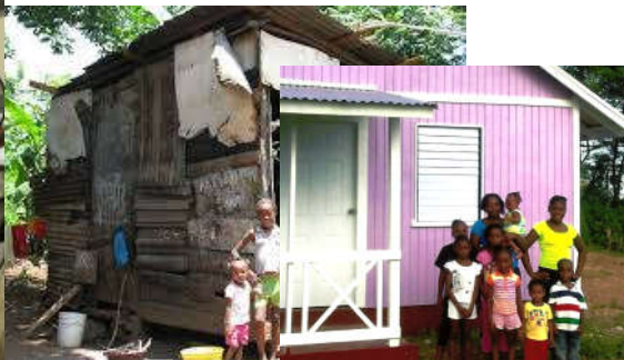
Shelter the homeless