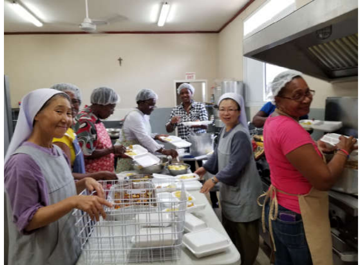
Love in Action Soup Kitchen

Jamaican Choir returns to sing at St John's masses Feb. 22-23, 2020.