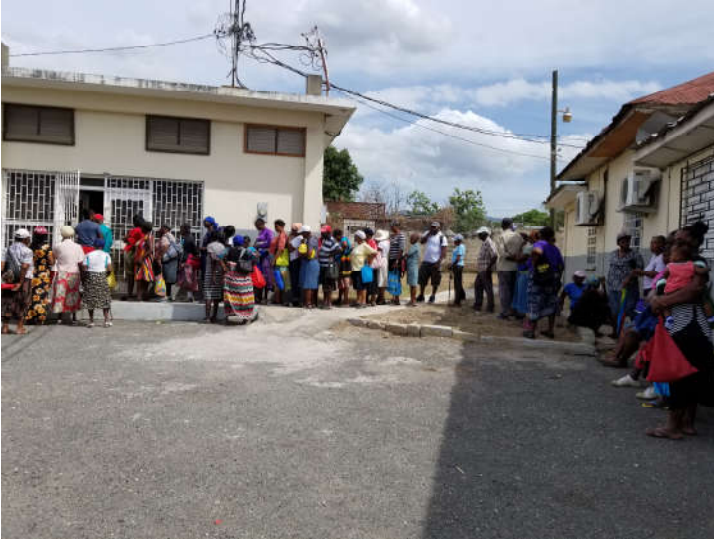
Lined up at the St. Pius X Food Pantry

For more information on Foods and Goods you may contact Jeff Meyerson at 239-592-5781