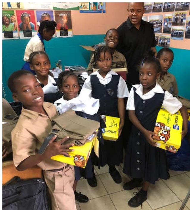
Students at DuPont School getting new uniforms and shoes

DuPont received money to completely update and rewire its computer and internet system. This resulted in an innovative reading program, funded by JOP, being added to the curriculum. JOP purchased shoes and uniforms for 50 needy students. In Jamaica, parents are required to purchase shoes and uniforms in order for their children to attend school. In an effort to combat truancy, it was found that several children were not attending school because they lacked shoes.