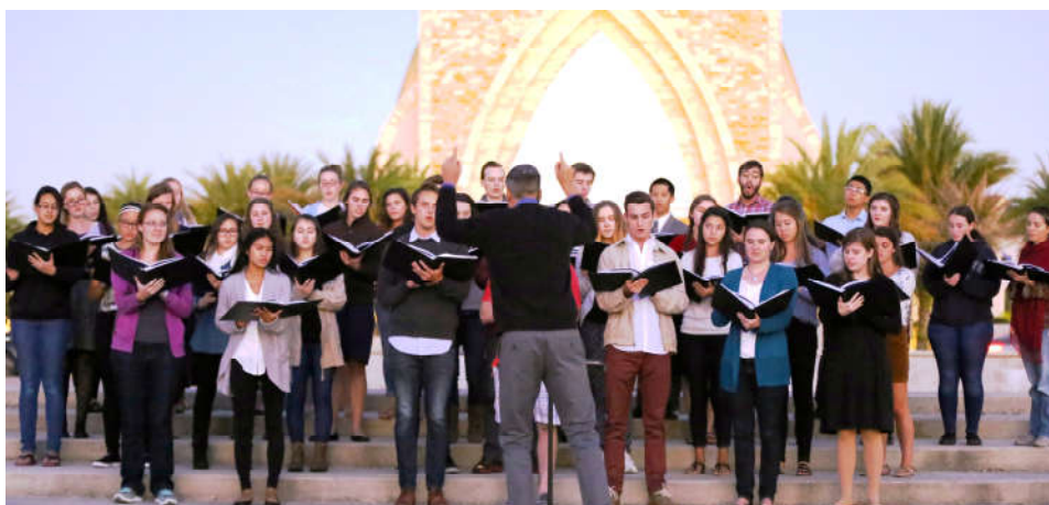
Ave Maria University Music Dept. A perennial favorite.