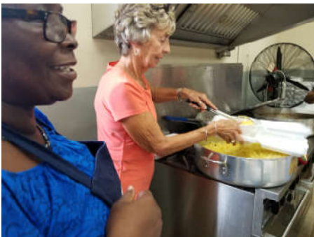
Feed the hungry

As individuals here in Naples and across the country, performing these works of mercy is not easy. Your financial support of Jamaica Outreach Program (JOP), and/or volunteerism, makes you an active participant in bringing sorely needed medical, dental, vision care, food, education and housing services to the poor in Jamaica. The results highlighted in this newsletter summarize the good works you have enabled JOP to deliver in the past fiscal year. Thank you for your prayers and support of our ministry!