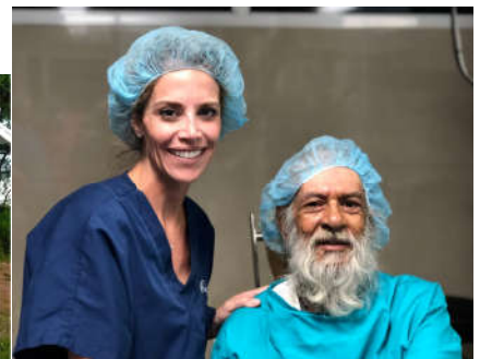
Visit the sick