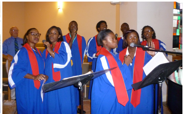
Jamaican Choir 2016. Choir returns to sing at St. John's masses Feb. 4-5, 2017.

Jamaica Outreach Program P.O.Box 110581 Naples, FL 34108-1929