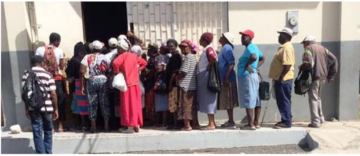
Food Line at St. Pius Food Pantry

Once again over 1,000 parishioners of St. John the Evangelist Church in Naples displayed overwhelming generosity in the support of our annual Lenten food drive. We were assisted by over 50 volunteers who included cub scouts, high school students, and senior citizens in the sorting, packing and boxing of nearly 500 cartons of food on a very warm Saturday and Sunday in March. This year's food, valued at over $17,000, is distributed to the impoverished families at St Pius Church