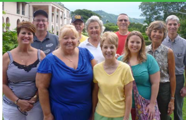
Nov. 2013 Optical mission team