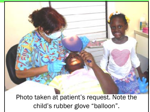
Photo taken at patient's request. Note the child's rubber glove "balloon".

In October of 2014, we begin a fluoride varnish program at the DuPont School in an effort to curb the spread of decay in those young teeth. ... Continued on page 8