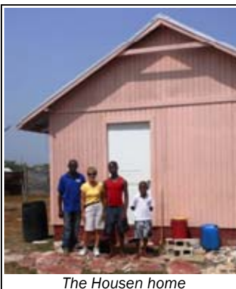
The Housen home

“...it’s a luxury of living somewhere with a locked door.”