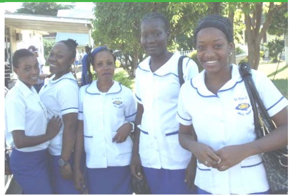
St. Pius X Skills Training Center students 2014

St Pius X parish in Kingston runs a Skills Training Center educating 51 adults in a 9 month long course for job skills in either food preparation or cosmetology. The courses also include basic math, English and computer training. JOP provides the bulk of the funding for the operation of this critical program. JOP also provided some support to a similar Skills Training Center at St. Peter Claver. After graduation many obtain their first job. Unemployment in that area is over 40%.