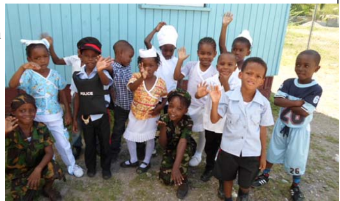
Career Day at African Martyrs of Uganda Parish Basic School